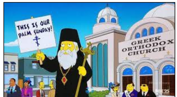
From the Simpsons TV show